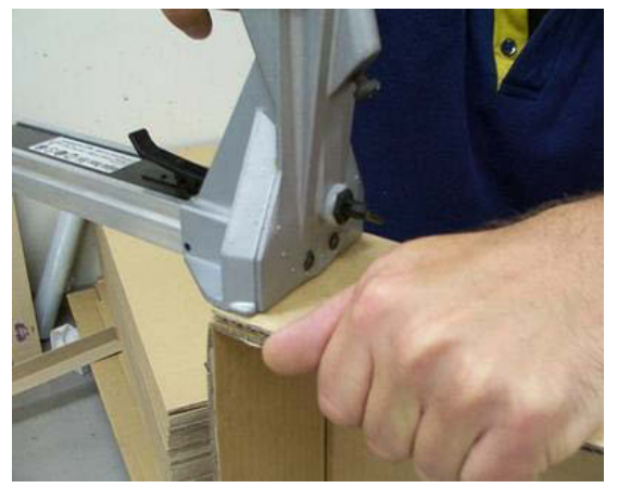
Figure 11 - Staple corners together

6.1.4. Repeat for each corner until all corners are securely stapled together.