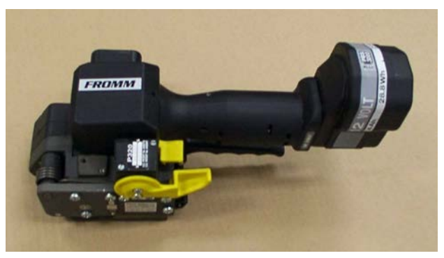
Figure 1 - The Fromm Polystrapper

The Fromm Polystrapper (Figure 1) is a hand held portable device designed to place tension on plastic straps and then heat glue the straps together. It is important to make sure that the Polystrapper is operated correctly to ensure a good seal of the straps.